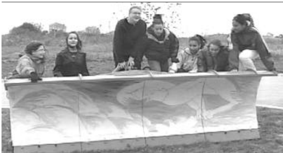
Jawthorn Junior High students designed and painted one of our Village snow plows. The scene, which includes the school’s eagle mascot, is shown here in its early stages. West Oak Middle School in Mundelein also participated in the project.

The Vernon Hills Building Division wishes you a safe and joy filled holiday. In celebration, residents are welcome to decorate the exterior of their property. At the risk of sounding like Scrooge, we remind you that Village ordinances state that decorations can be installed up to 30 days prior to the holiday and should be removed within 30 days following the event. Most importantly, please remember to use decorations and extension cords listed for outdoor use. Happy Holidays!