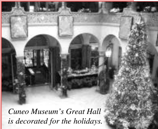
Cuneo Museum's Great Hall is decorated for the holidays.