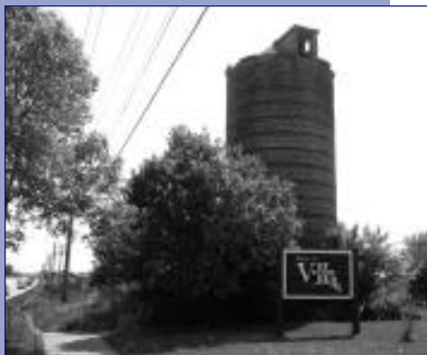
The silo at the western entrance to the Village on Route 60 will soon have a new view. Crews are beginning construction of Aspen Pointe, located directly east of this landmark.