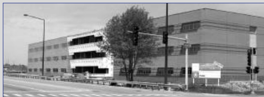
Lower left: Hawthorn's new Townline School will be ready for students this fall.