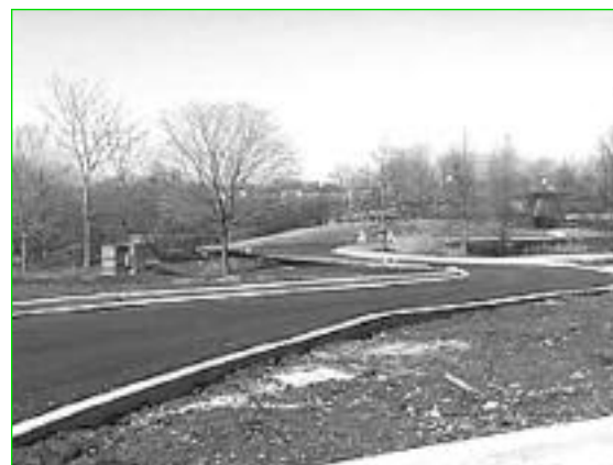
Crews will begin placing trees, benches, lights and more in the new portion of the Memorial Arboretheater, which adjoins the southern edge of the current site.

Harvey Lake: The Army Corps has committed $260,000 for improvements to Harvey Lake. As background, the Village obtained the deed to the lake and surrounding property as part of the Gregg's Landing development. In 2000, Lake County performed tests to determine the health of the lake. The Army Corps project