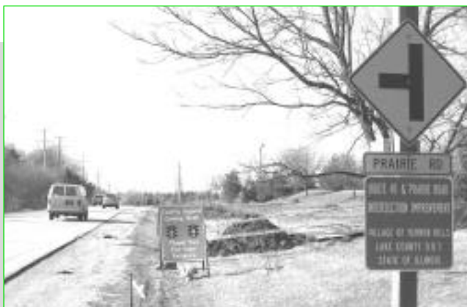
Fairway Drive at Route 45 will become increasingly busy as crews move utilities, install temporary traffic signals, and construct this new intersection. Most of the work is expected to be finished by Thanksgiving.