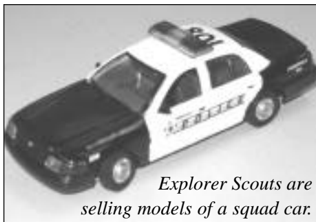
Explorer Scouts are selling models of a squad car.

Each car costs $20 and can be picked up at the station on Monday through Friday from 8 a.m. to 4 p.m. For $5 more they can be shipped to you. For details, call 847-362-4449, ext. 4821.