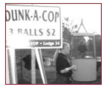
Summer Celebration included free concerts, including Planet Strange (above), as well as a chance to raise money for community programs (top right). Thanks to the dozens of local kids who created the Celebration mural, which will be displayed around town.