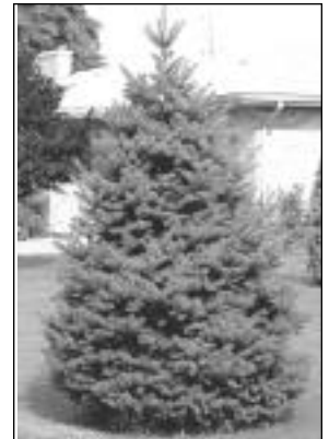
Colorado Green Spruce

Note: In an effort to hold down expenses, Public Works employees will not be providing free woodchip delivery this year. However there is always a large supply of free woodchips available at Public Works. Please bring your own shovel and containers.