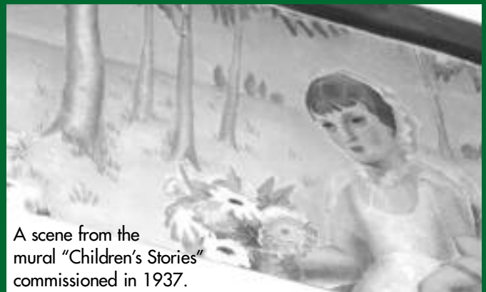
A scene from the mural "Children's Stories" commissioned in 1937.